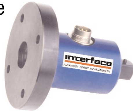
TS16 Square Flange Style Reaction Torque Transducer